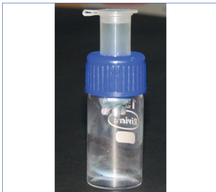
[Table/Fig-1]: Bacterial leakage model used in the study.